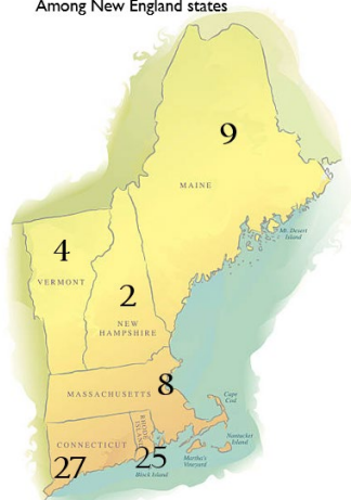
Figure 1: Rhode Island's Air Pollution Ranking Among New England states